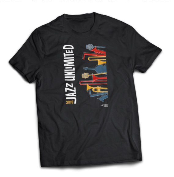
Get your limited edition 2018 Jazz Unlimited T-shirt - $10 each